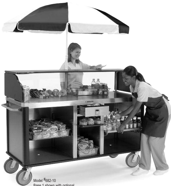
Model #682-10 Base 1 shown with optional slide-out and universal shelves, cash drawer and umbrella.

Stainless Steel with Laminate Exterior and Serving Counter